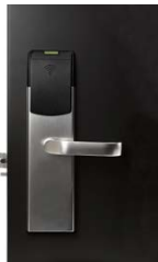
VingCard Classic RFID