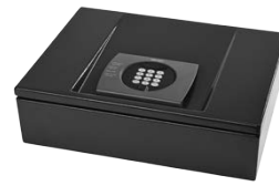
Elsafe Infinity II