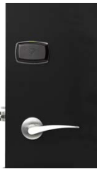
VingCard Signature RFID