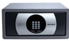
Elsafe Infinity II