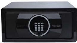
Elsafe Infinity II

Our safes share technology with our electronic locks enabling Visionline to operate both product lines within the same solution.